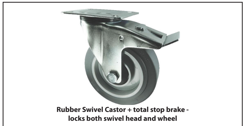
Rubber Swivel Castor + total stop brake - locks both swivel head and wheel