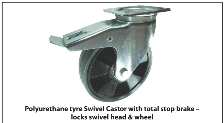
Polyurethane tyre Swivel Castor with total stop brake – locks swivel head & wheel