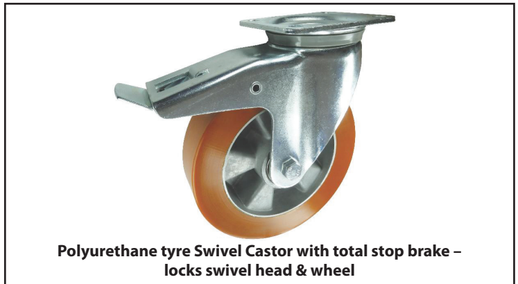
Polyurethane tyre Swivel Castor with total stop brake – locks swivel head & wheel