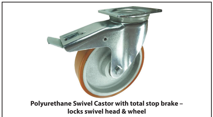
Polyurethane Swivel Castor with total stop brake – locks swivel head & wheel